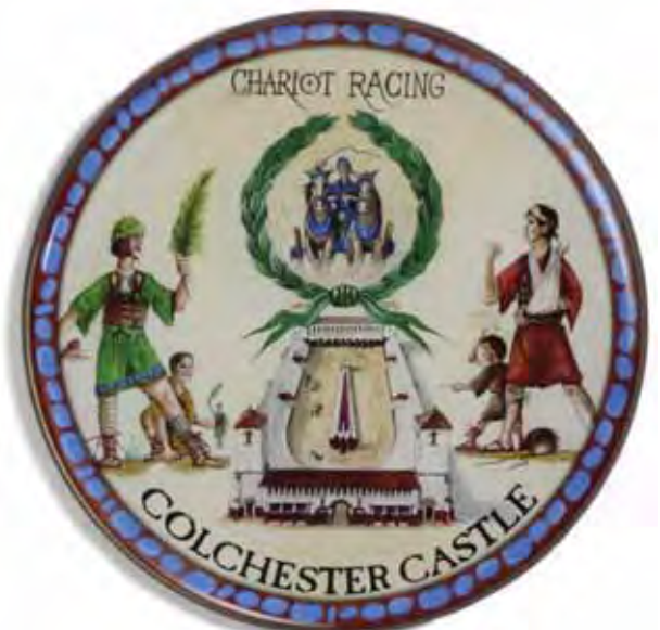
produced for "© Colchester Museum"