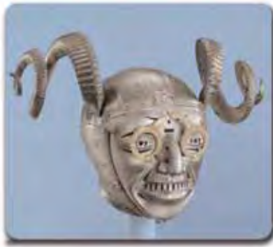
produced for "©The Royal Armouries"