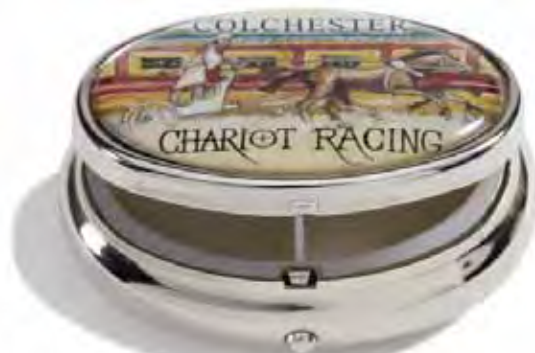
produced for "© Colchester Museum"