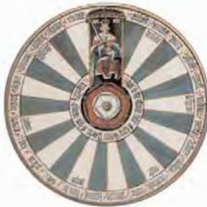
produced for "©The Great Hall, Winchester"