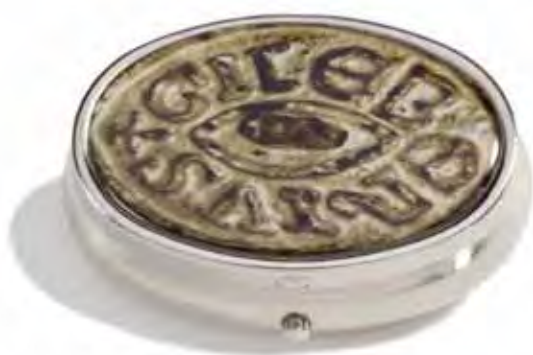
produced for "© Colchester Museum"

Our "Crystal Lens" manufacturing capability provides a unique quality and feel to many of our products. For instance, the keyrings are no ordinary keyrings - hold and touch them - dig your nails into the clear doming section and the marks all just bounce back without a trace - a quality keyring at a great price with a striking high image quality due to the magnification of the lens. Ever thought of having your own range of phone charms - now you can.