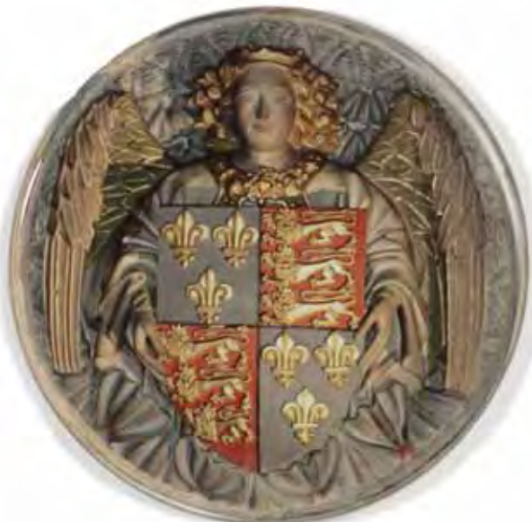
produced for "© St. George's Chapel, Windsor"